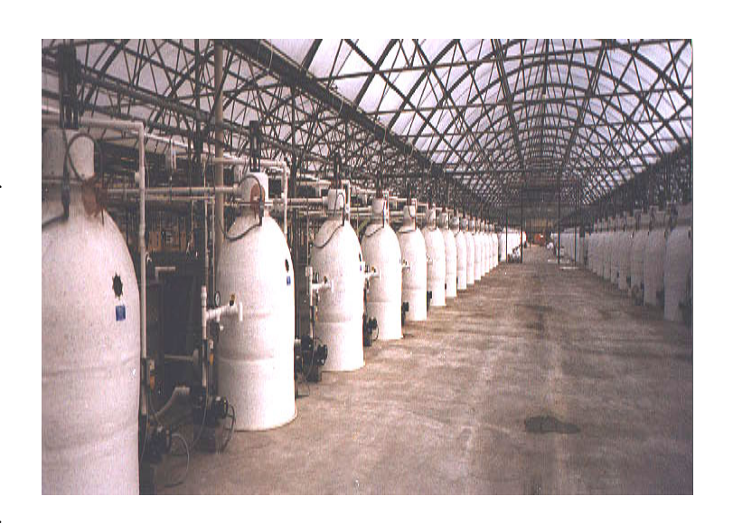
Bead Filters at a Large Midwestern Tilapia Facility (Malone et al)