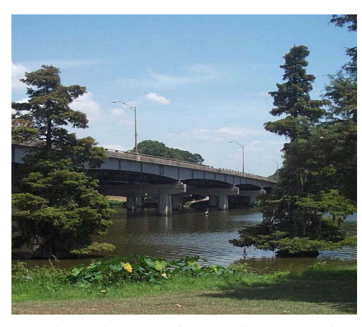
I-10 bridge at City Park Lake integrated with urban ecological system. The research site is located beneath the abutment to the right of the picture. (Sansalone et al)