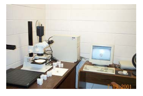
Optical Imaging System