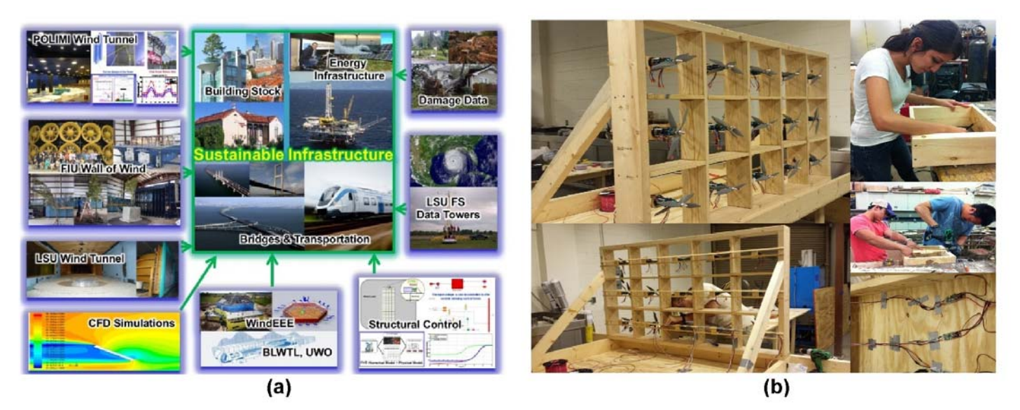
LSU hurricane testing: (a) Dr. Aly's expertise and long-term multi-scale multi-physics research goals in wind engineering; (b) Small-scale WRW testing facility in construction

The LSU's innovative hurricane facility will be concerned with the study of the impact of hurricane wind, rain and waves on energy infrastructure (power transmission lines and towers, green energy infrastructure, inland and offshore wind turbines, solar panels/collectors, oil platforms) and the built environment at large (low-rise buildings, coastal bridges, building envelope, etc.), with an objective to build the more resilient community. The facility represents a modern transition from traditional wind tunnel testing to large and full-scale testing under realistic hurricane wind, rain and wave loading. This will permit to examine the performance of large and full-scale infrastructure built from true materials to ascertain both security and economic construction.