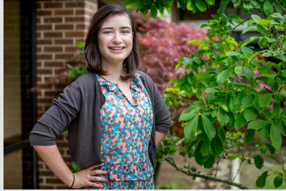
Scoville Peace Fellow

AgCenter researchers have formulated a matrix that could both <u>prevent and treat</u> <u>cataracts</u>, a leading cause of vision loss in older adults.