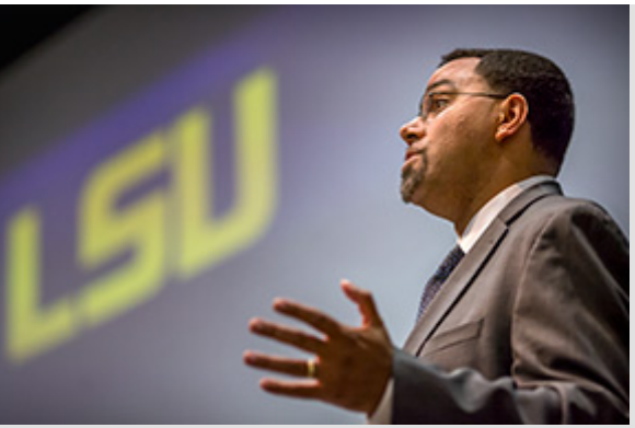
Opportunity Across America

LSU has welcomed its most <u>academically</u> talented freshman class, along with setting records for overall enrollment of African American and Hispanic Students