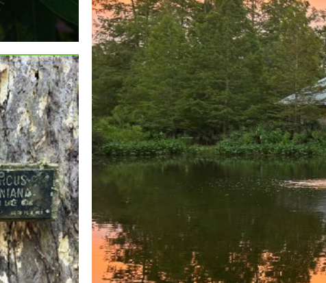
News and Events