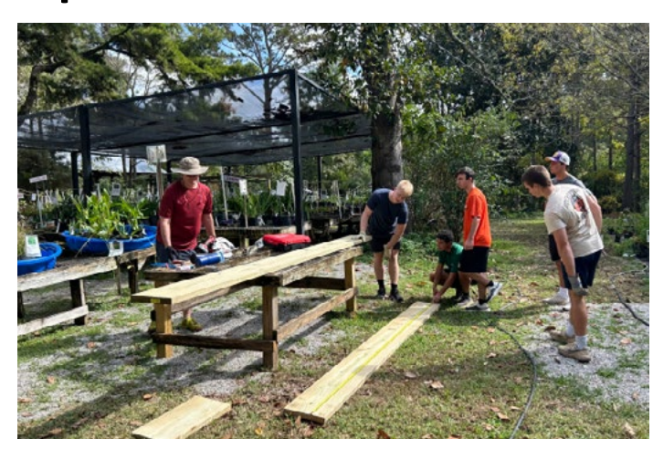
Scouts BSA Troop 7 at St. Aloysius Church in Baton Rouge contributed their time, talent, and materials to design and construct a much-needed soil bin and shade structure in the Hilltop nursery.