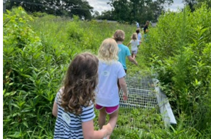
Campers exploring the meadow