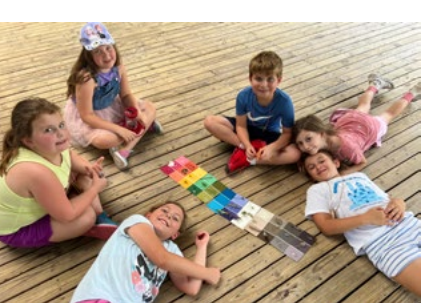
Campers learning the nature color whee