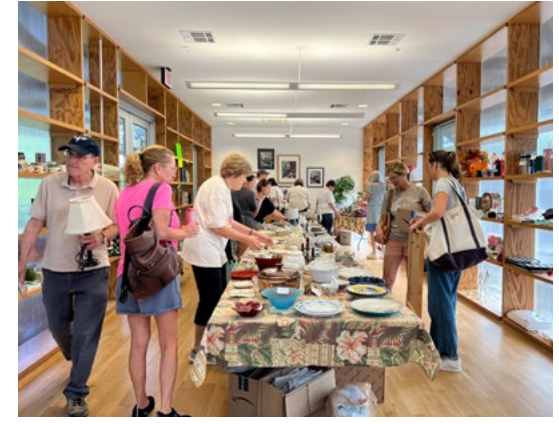
Spring Fling Yarden shoppers in the Hilltop Arboretum library

Visit Yarden for a bargain while at the sale! All Yarden proceeds directly benefit Hilltop.